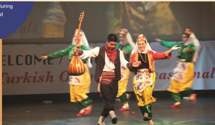
Joy and celebration during Turkish Olympiad

Launched in 2003, this now widely popular event brings together students from all over the United States to compete in a demonstration of their Turkish language and culture skills. Every year, each of the Turkic federations selects a finalist to participate in the various categories at the Worldwide Competition. This exclusive program encourages youth cultural education and personal development, provides a lot of excitement for the participants and the millions of TV viewers, and celebrates Turkish culture and language.