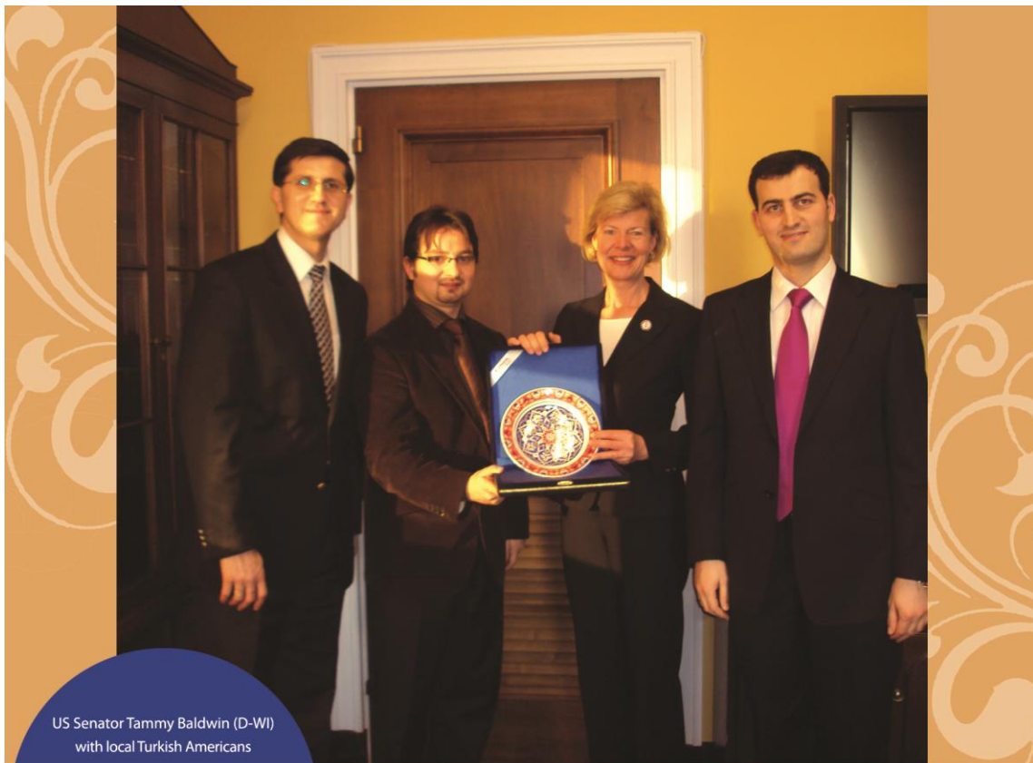
US Senator Tammy Baldwin (D-WI) with local Turkish Americans