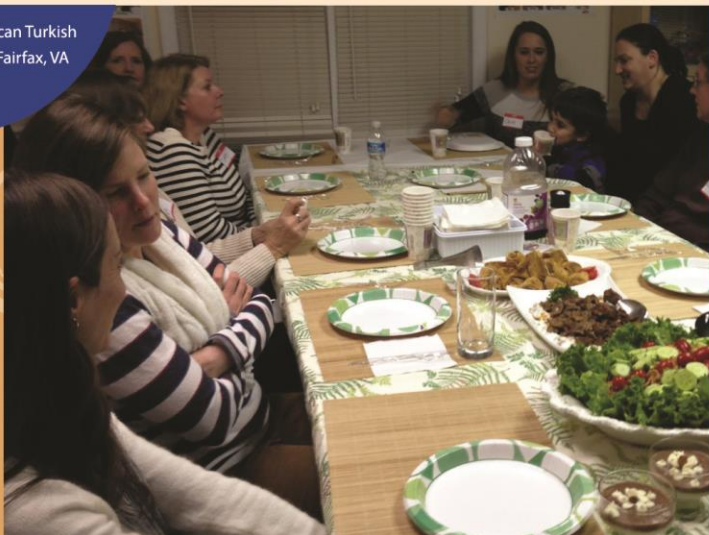
Cooking classes at American Turkish Friendship Association Fairfax, VA

The Turkic community in the United States is exceptionally active in its efforts to reach out to other religious and ethnic groups, as well as to the wider community, and share with them the rich Turkic cultural legacy and the best of its artistic, educational, and culinary traditions. Local community development and expansive cultural outreach are central to the Turkic American Alliance and its members' overall mission in the United States. Our cultural centers continuously enhance the cultural and social life of our community and serve our localities through a wide gamut of local and national programs and events. They provide spaces for cultural dialogue and exchange, education and training, and are at the heart of our commitment to the wider neighborhood and its specific needs. They host Turkish language classes, cooking classes, weekend and summer school for kids, seminars, dialogue and networking dinners, disaster relief campaigns, sister city initiatives and special holiday celebrations. Local elected officials are often invited to converse, celebrate or address important local issues at the centers.